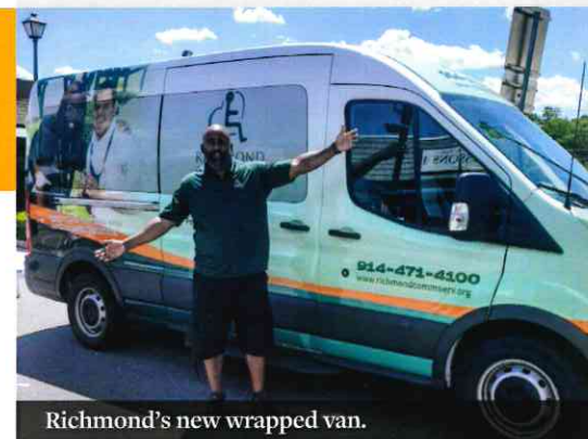
Richmond's new wrapped van.