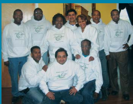
The recent dedication of members of the Richmond maintenance staff in the construction of the new "Home in a Home" at 919 North Broadway made a huge difference to individuals at Richmond.

Go to the "contact us" page to share your feedback on the site, which we will update frequently to keep you current on the exciting events happening at Richmond!